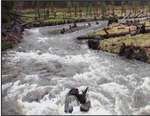
Trout Creek is part of the Wind River watershed, which is now one of the few watersheds in the Columbia River basin that is entirely free-flowing from its source to its confluence with the Columbia.

As our long time supporters know, in Spring 2008 the Gifford Pinchot Task Force created and published a restoration plan for the Gifford Pinchot National Forest entitled Restoring Volcano Country (click the title to view the plan on our website). After three years of steady work toward accomplishing the many projects and priorities outlined in this long-term plan, we are proud to present you with an update of some on the ground successes and a preview of more that will be completed this summer.